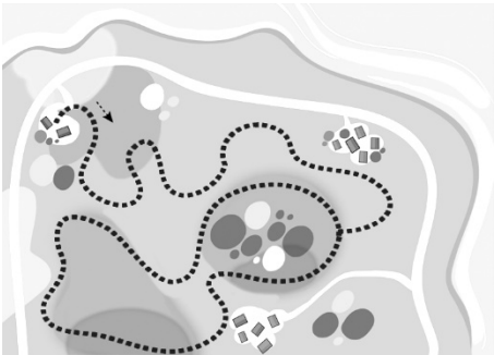
Wilderness trail: 7 km

Two students walked the Wilderness Trail. Charlie walks at a moderate rate. Suki walks at a fast rate. How long did it take each student to walk the trail?